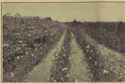
HEAD OF THE HOUSE!